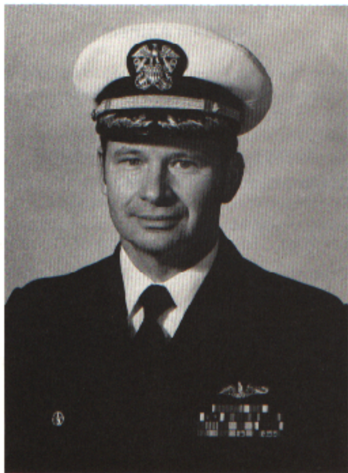
COMMANDER CHARLES LEIGHTON MOORE, III United States Navy